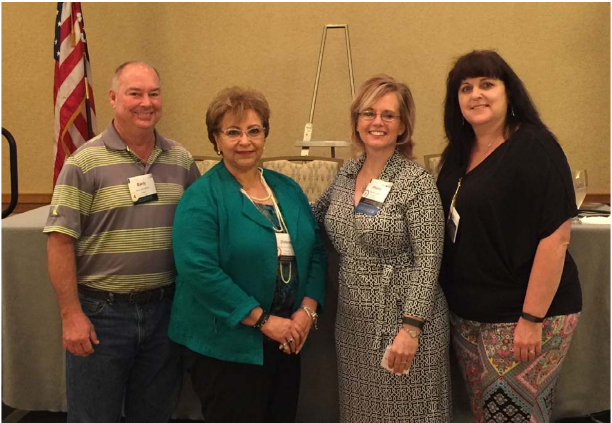
Finalists for 2016 Outstanding Treasurer of the Year