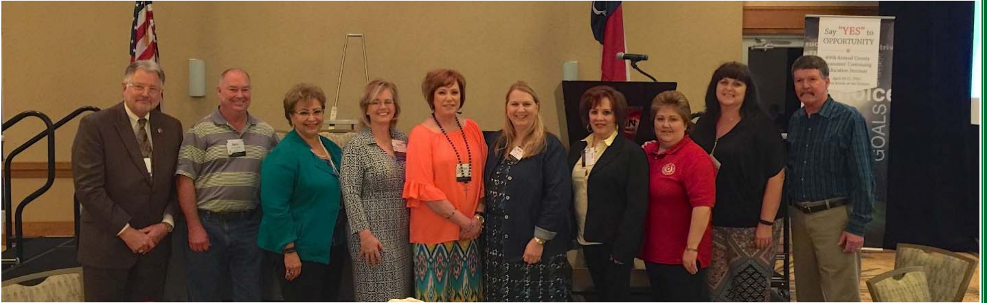
Nominees for 2016 Outstanding Treasurer of the Year